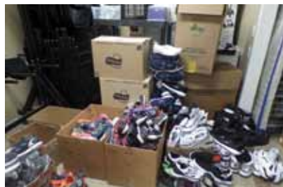
October 10: Thanks to Samaritan's Feet we were able to distribute 250 pairs of shoes children and families.