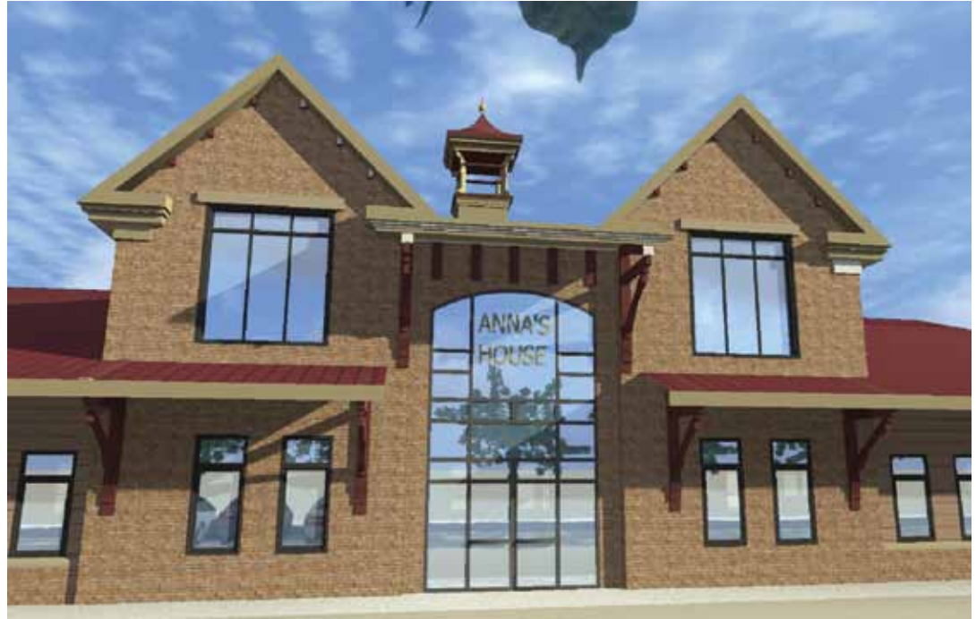
The new Anna's House offers a welcoming facade to the community.

The capital campaign for our new multi-service center is in full swing. Through significantly expanding our physical space in the new facility, we will be able to serve groceries to approximately twice as many families as we currently serve.